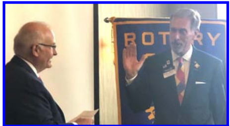
A New President