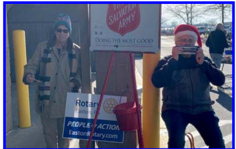
Rotary Bell Ringers

Jingle Bells: Easton Rotarians were on hand at Sam's Club to ring the bells for the Salvation Army. Once again, we have accepted the challenge of the Easton Lions and the Easton Kiwanis. Unfortunately, we slipped to 3 rd place this year. The good news is that the Salvation Army received donations of $3,953.32.