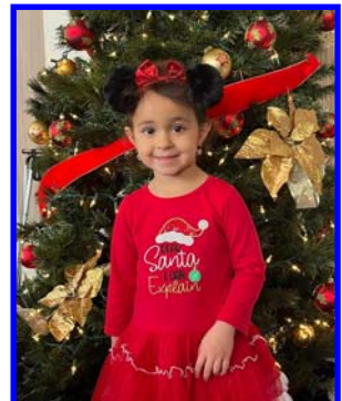
Breakfast With Santa at the Pomfret Club