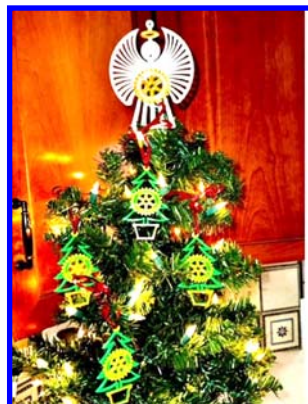
The Terry Tree