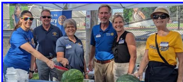
Rotarians With Sharp Knives

The West Ward celebrated National Night Out and Team Easton Rotary was on the scene at the Outdoor Market. Free watermelon was served to a great crowd on a terrific night in Easton.