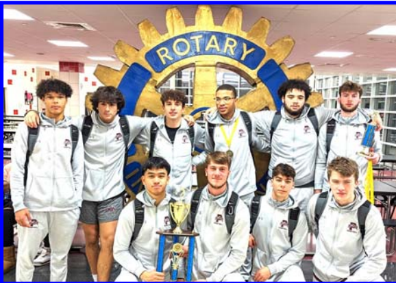
Varsity Champion Liners