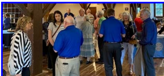
A Great Night At Kellyn