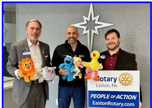
For The Kids

Bear Day: Easton Rotarians were on the road to local hospitals delivering stuffed animals for the children. The gifts were delivered to St. Luke's Anderson, St. Luke's Children's Hospital, and Lehigh Valley Health Network Reilly Children's Hospital. The Saturn on the Square money has now exceeded $1,900.