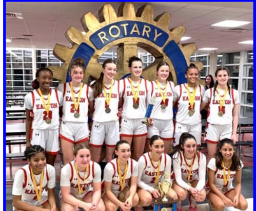
Varsity Champion Rovers

And so, we come to the end of 2023. Halfway through the Rotary year and it has been a busy one. On the horizon are more student awards, social events, new members, Foundation grants, and a Bethlehem-based District Conference. Please encourage your friends to come join us as we continue to Create Hope In The World.