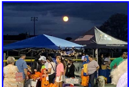
Easton Rotary Field

Rotary Fellowship: The evening social was held at the ever popular Weyerbacher Tap Room. A special appearance was made by some stuffed animals and the Studio DNA photo booth.